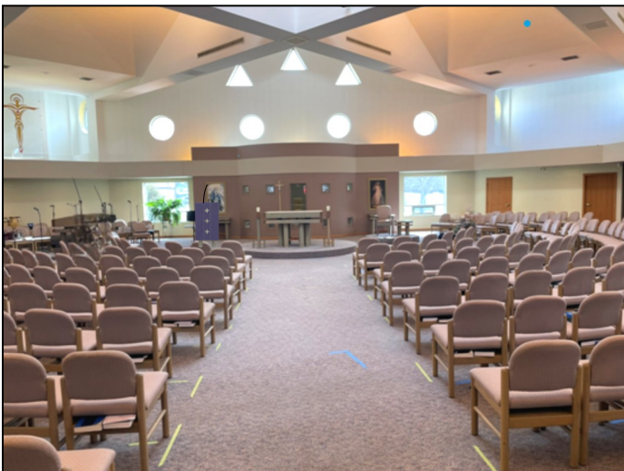
View from the "test run" outside the vestry towards the tabernacle in the Blessed Sacrament Chapel.