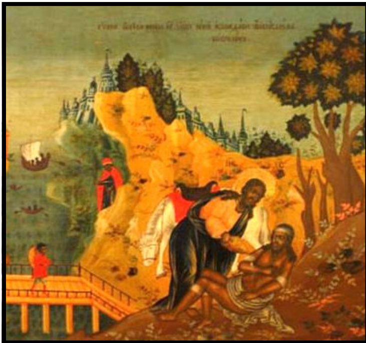
Good Samaritan (Russian Icon), late 18th century, Anonymous

Our vision is to be a life-giving community committed to welcome, to worship, to grow, and to serve.