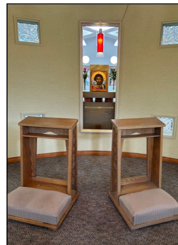
View from inside the chapel

The feedback during this week has been generally quite positive so far since moving things last Sunday afternoon. It took us about 3 hours with a great team of 20 or so—thank you to those who contributed their time and energy and passion! And we've made slight tweaks to things here and there this week, anticipating likely needs that will arise. So please feel free to contribute your feedback, thoughts, and feelings about the changes, which help our team who have been working on it for over a year make improvements. While we're quite happy with how things seem to have turned out, we know we have more work to do, especially regarding the final resting place of our tabernacle. You'll notice it is now in front of the wall of the chapel, rather than behind it, which is a temporary solution. The full vision is to have it mounted in some way within the wall itself, such that it is still visible and accessible in the sanctuary for Mass, while also still being in the chapel for more personal and private prayer. Along with evaluating and improving things so far, our team will now be looking and planning for that change.